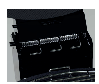
Easy lift hinge system